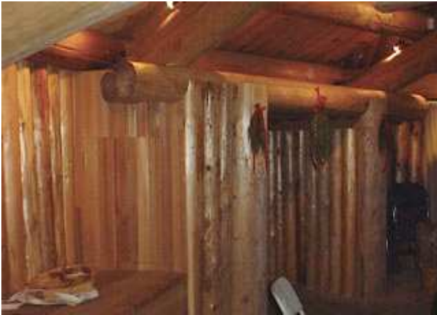
Inside the Pit House at Xa:ytem